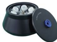
87160250 4 x 250ml