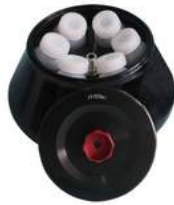
87160500 6 x 500ml

*We provide custom solutions for specialise containers and vessels. Contact us with your requirement!