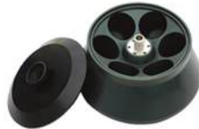
87161000 6 x 1000ml