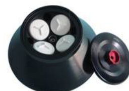
87140500 4 x 500ml