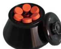
88201008 6 x 50ml